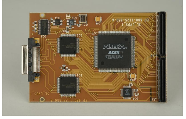
Figure 2 : CMC transmitter board

-data is transferred on a LVDS technology with a multiplexing of 8 to minimize the numbers of copper conductors.