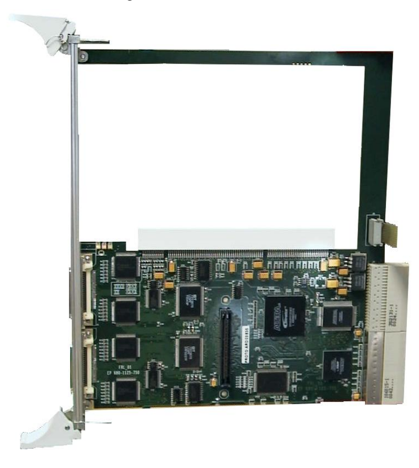
Figure 3 : FRL CompactPCI board

A hole is done on board to accept a PCI board (NIC card) that will be plugged in the straddle PCI connector (see figure 3).